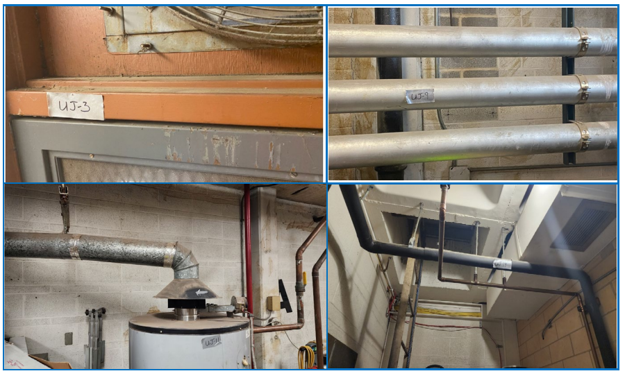
Figure 2 - Examples of dirty surfaces where swipes were taken

The school was well maintained from a cleanliness standpoint, so finding dirty areas was not easy for taking biased swipes. The swipes from 19 locations (example areas shown in Figure 2) were analyzed for alpha and beta radioactivity and for lead-210. No lead-210 was found on those swipes, and alpha and beta radioactivity were consistent with background levels.