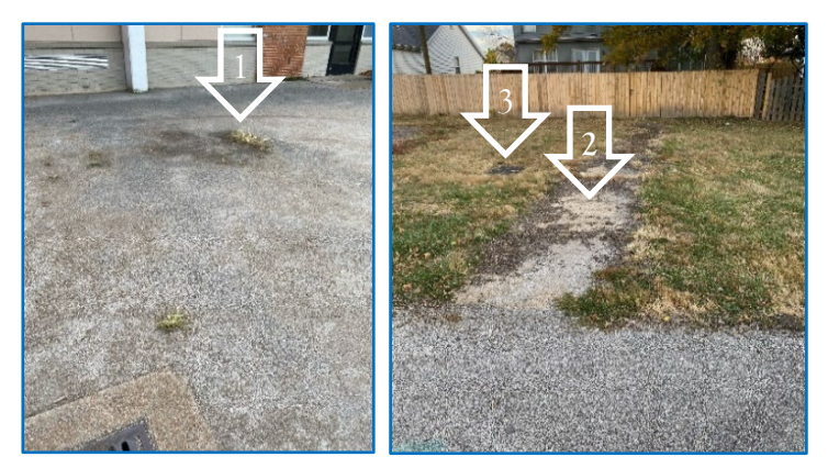
Figure 3 - Locations of pavement sediment samples

As shown on the decay chain on the previous page, radon is a noble gas that can exit the soil before decaying to polonium-218. The four radionuclides from polonium-218 to polonium-214 have decay half-lives of days or less, while lead-210 has a half-life of 22 years. In the air, all 5 of these radon-222 decay products will attach to particulates that are always floating in the air. These particulates eventually settle out onto surfaces. This settling process is often uneven, depending on the type of particulate, the material the surface is made of, static electricity, and precipitation.